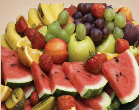
Fresh Fruit Platters